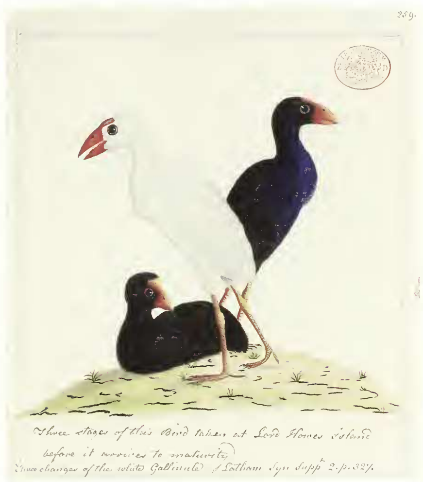
Figure 8. Illustration by an anonymous artist of three Lord Howe Gallinules Porphyrio albus from Thomas Watling's collection, NHMUK-L-Watling-330-M-1; the handwritten note reads 'Three stages of this Bird, taken at Lord Howes Island, before it arrives at maturity (Natural History Museum, London)

gallinule (cf. Iredale 1910, Hindwood 1932). Despite this lack of first-hand evidence, several commentators confused the provenance, even leading to the description of supposed Norfolk Island birds as a second species of white gallinule.